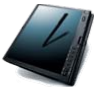
Lenovo Thinkpad X61 Tablet