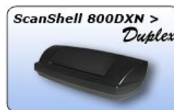
Duplex Medical Insurance Card Scanner