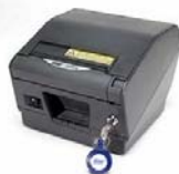
Star Thermal Prescription Printer