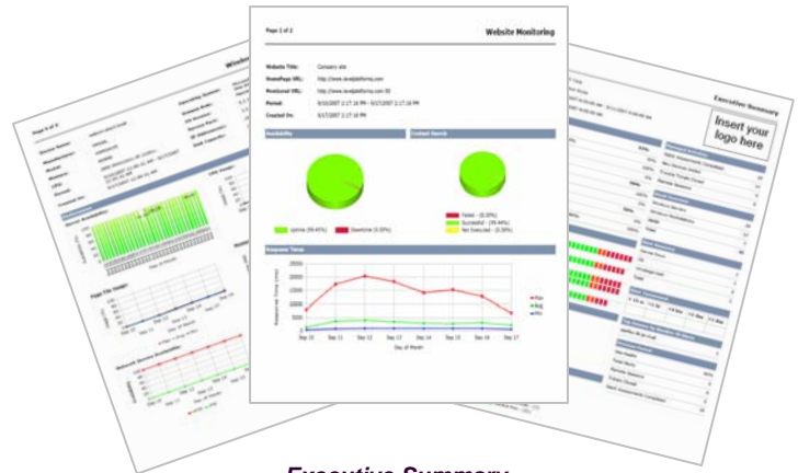
Web-based Central Dashboard