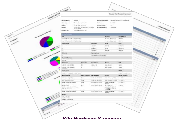
Site Hardware Summary Device Attributes Software Asset Inventory