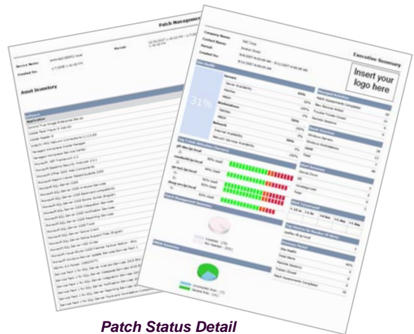
Patch Status Detail Server Health Report